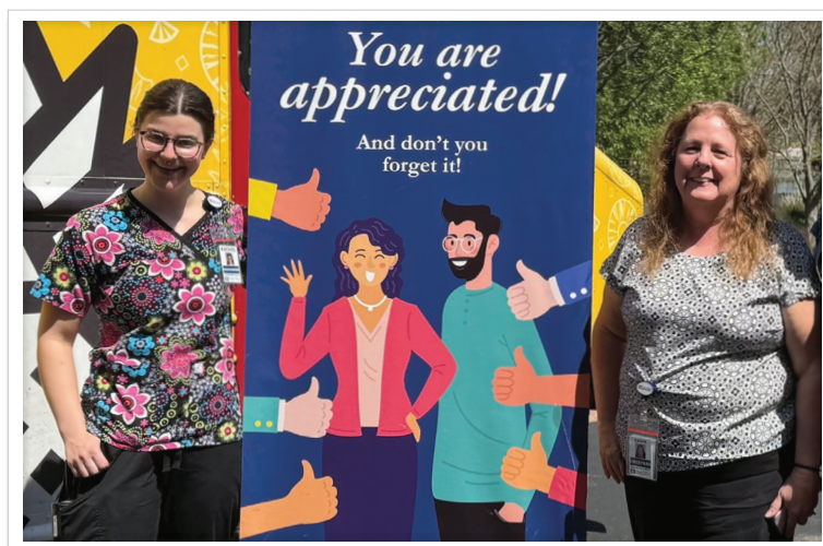
Three Pillars' staff enjoyed a food truck lunch courtesy of the Staff Appreciation Fund.