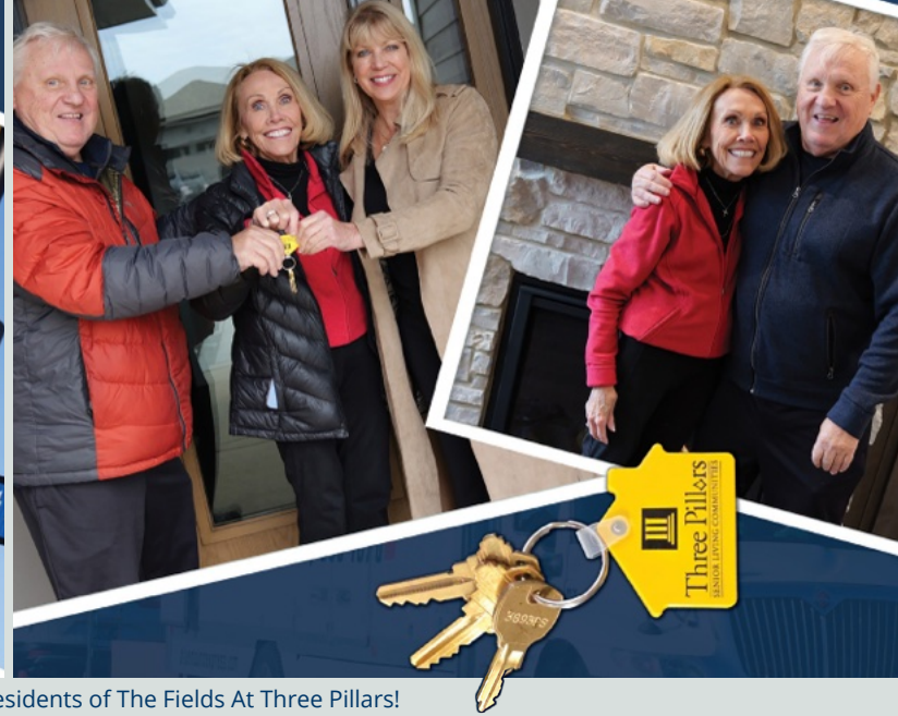
Move-in day for residents of The Fields At Three Pillars!