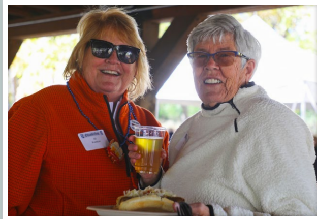
Future Fields residents joined us for Octoberfest

Wellness Connection: • Community members: 140 • Resident members: 69