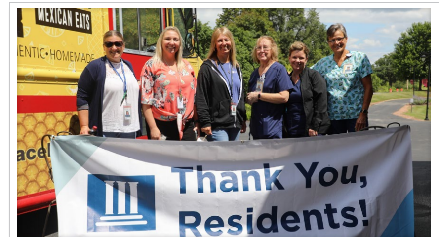
Three Pillars' staff enjoyed food trucks, thanks to the Staff Appreciation Fund