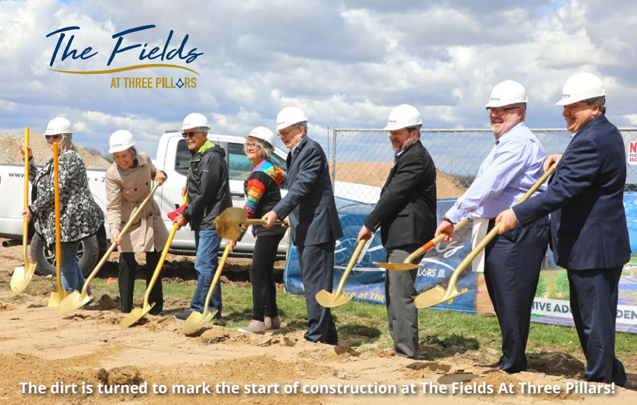
The dirt is turned to mark the start of construction at The Fields At Three Pillars!